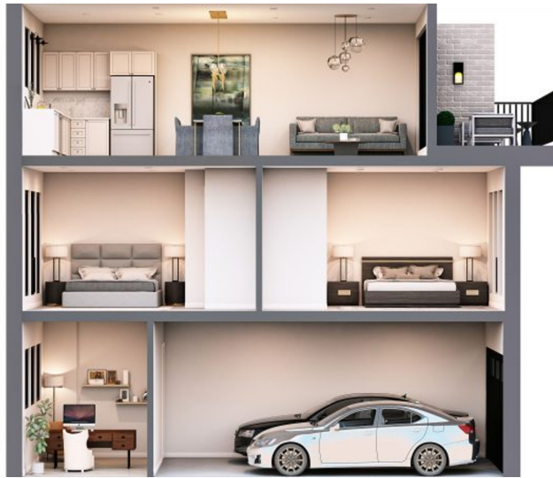
2 BEDROOM, 2.5 BATH