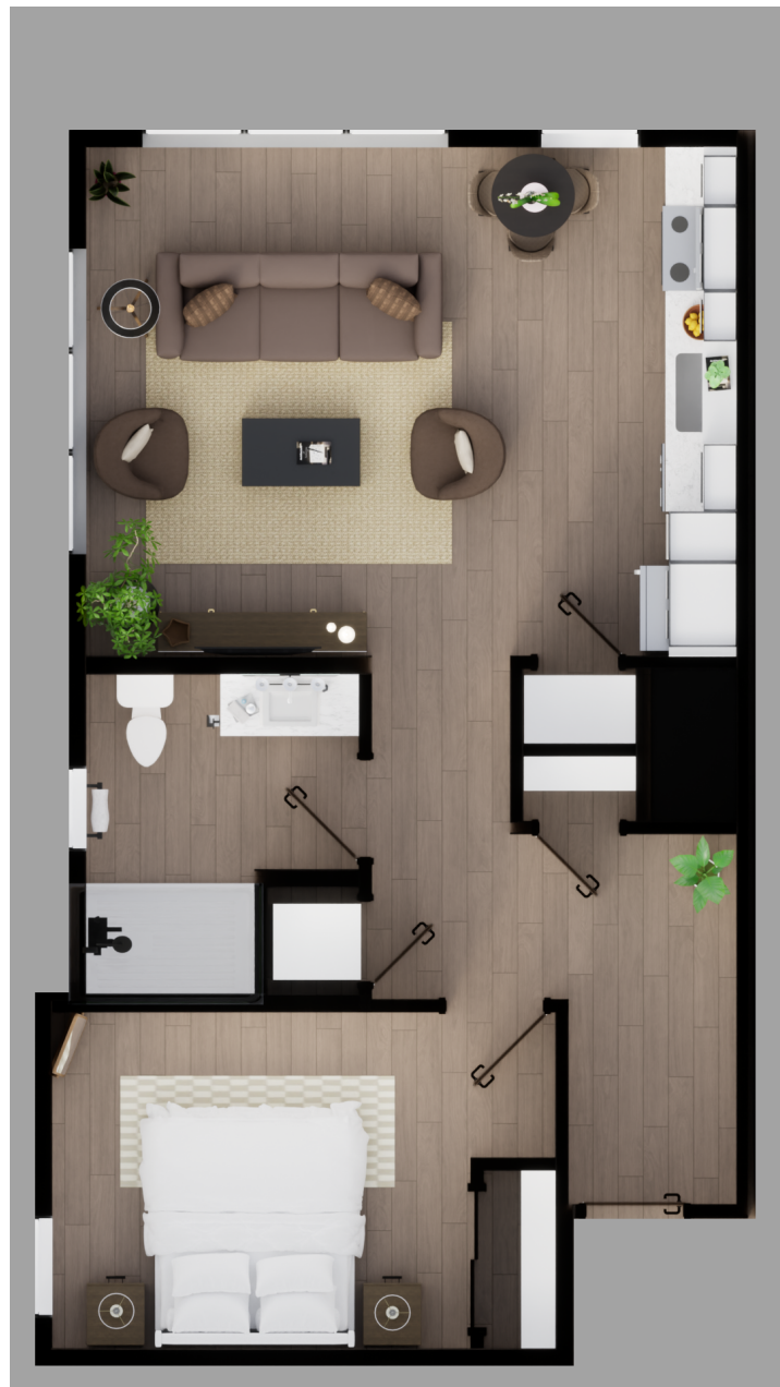
1 BED - TYPE B