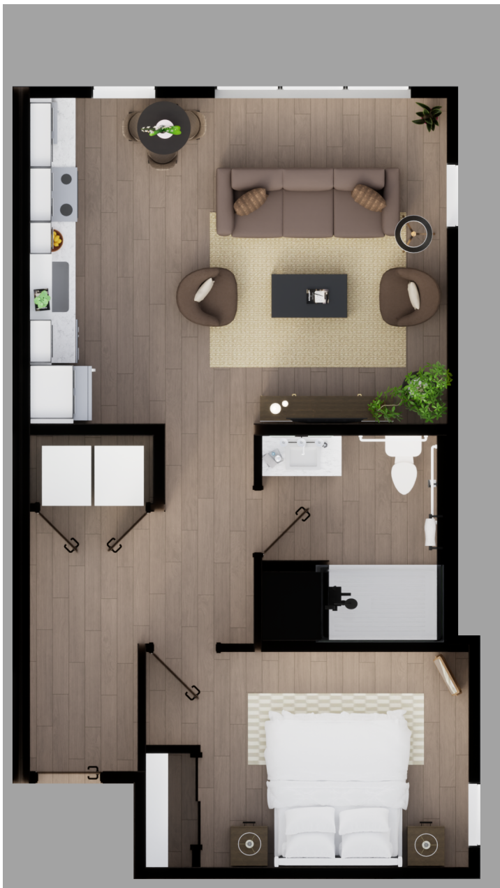
1 BED - TYPE A