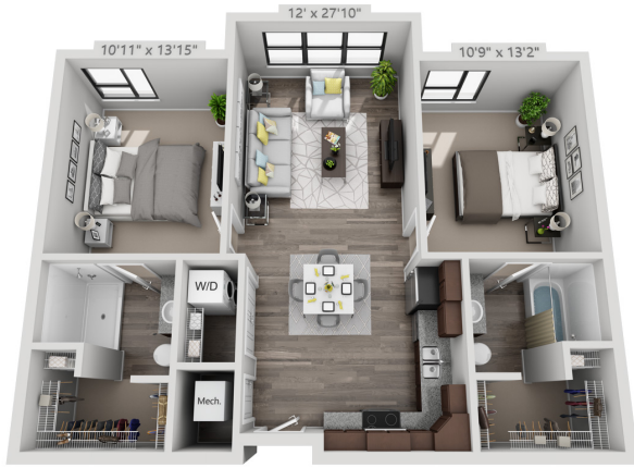
Renderings are an artist's conception and are intended only as a general reference. Features, materials, finishes and layout of subject unit may be different than shown. 3DPPlans.com