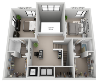
Renderings are an artist's conception and are intended only as a general reference. Features, materials, finishes and layout of subject unit may be different than shown. 3DPPlans.com