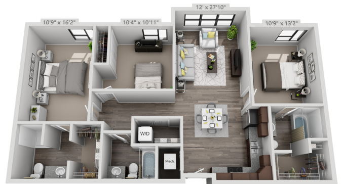
Renderings are an artist's conception and are intended only as a general reference. Features, materials, finishes and layout of subject unit may be different than shown. 3DPPlans.com